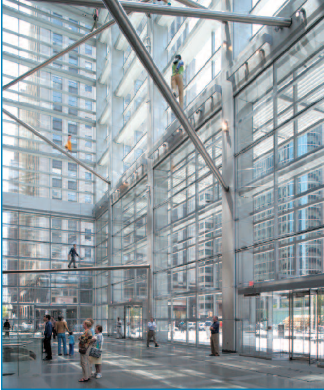
Comcast Center, Philadelphia, Pa. Architect: Robert Stern Architects LLP Glass Fabricator: JE Berkowitz, LP Glazing Contractor: Enclos

The clarity and environmental performance of Solarban 60 Starphire glass, fabricated by J.E. Berkowitz, LP, for glazing contractor, Enclos, and Robert Stern Architects LLP, are highlighted in the atrium, entryways, inset walls and crown of the soaring 62-story Comcast Tower in Philadelphia.